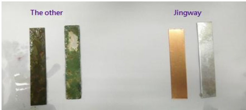
The metal piece after immersion test of other brand coolant obviously corroded and generate potential difference that cause a large amount of oxides adhering to the metal piece; in contrast with Jingway coolant, the result presented no obvious oxidation.

Put copper and aluminum metal piece into other brand and Jingway CP series coolant. Perform oxidation experiment under the condition of normal temperature 50°C and carry out more than 6 months in order to observe the metal protection by different coolant.