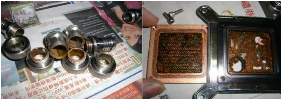
Examples of metal corrosion: Metal corrosion deposits tend to accumulate on the cold plate, a structure with naked metal and dense fins, as well as lead to clogged pipes, flow decrease and even malfunctions such as abnormal temperature rise of the machine.

The metal components in the water cooling system are usually made of copper and aluminum. Therefore, the quality of the coolant as the contact medium will significantly affect the service life of the system; especially have great influence on metal protection. According to previous cases, coolant of bad quality leads to metal corrosion, even may cause clogged pipes, rust and coolant leakage which directly affect product life and the safety of customer property. As a result, Jingway focuses on this part and performs a series of enhanced experiments so as to achieve better results.