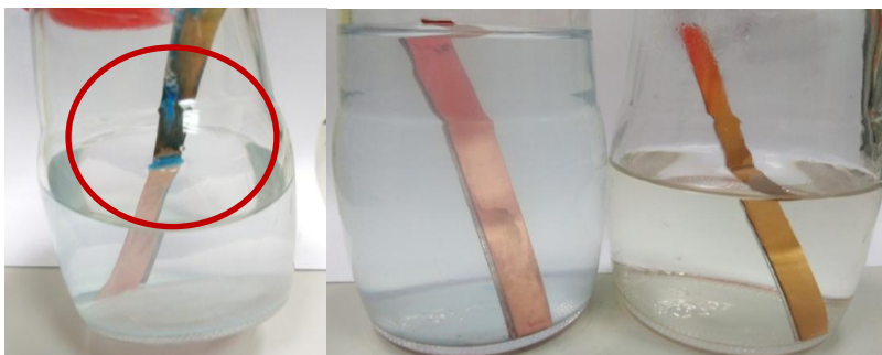
During the experiment, it can be found that other experimental groups had some problems such as crystals, blue discolorations of liquid (Metal ions led to oxidation color.), and so on; only Jingway coolant still remained clear and colorless.